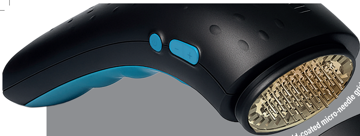
36 gold-coated micro-needle grid